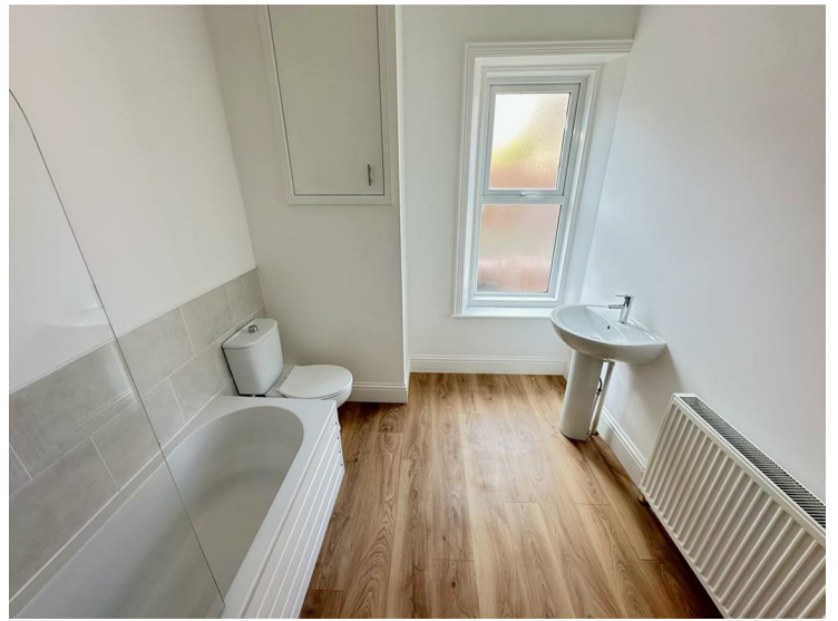
Bathroom 9'2" x 7'11" (2.799m x 2.414m)