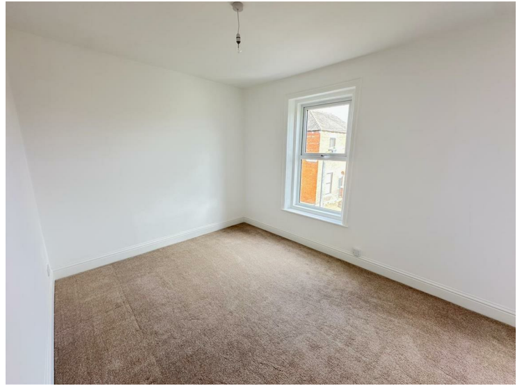
A double bedroom incorporating two double glazed windows to front and a radiator.