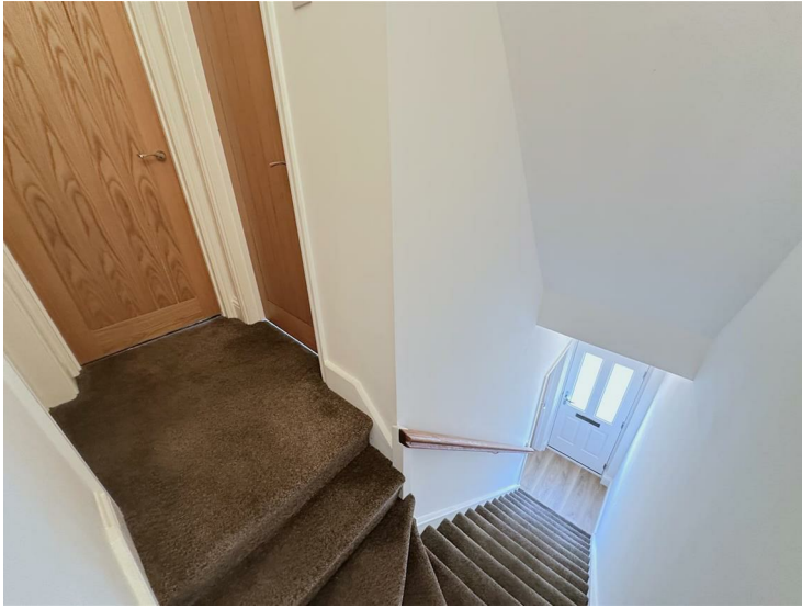
Incorporating loft access.