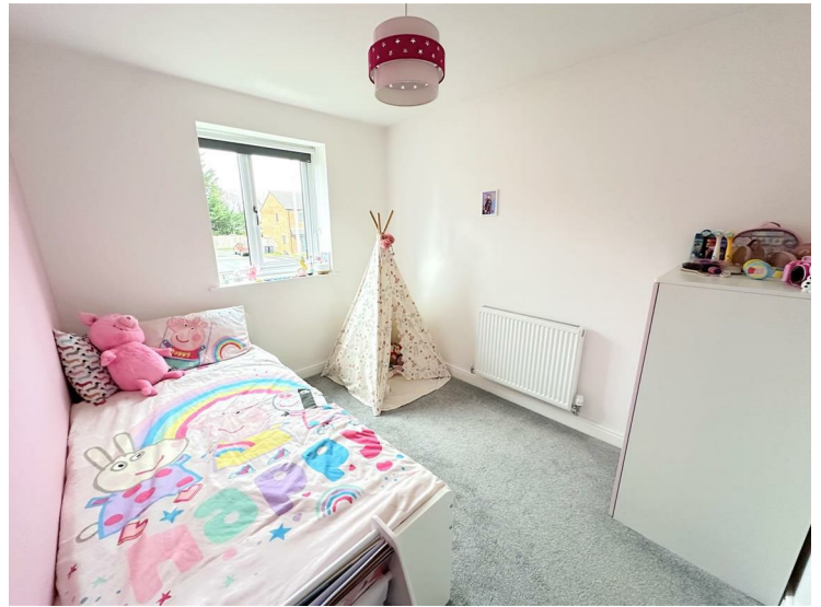
A double bedroom incorporating a double glazed window to rear and a radiator.