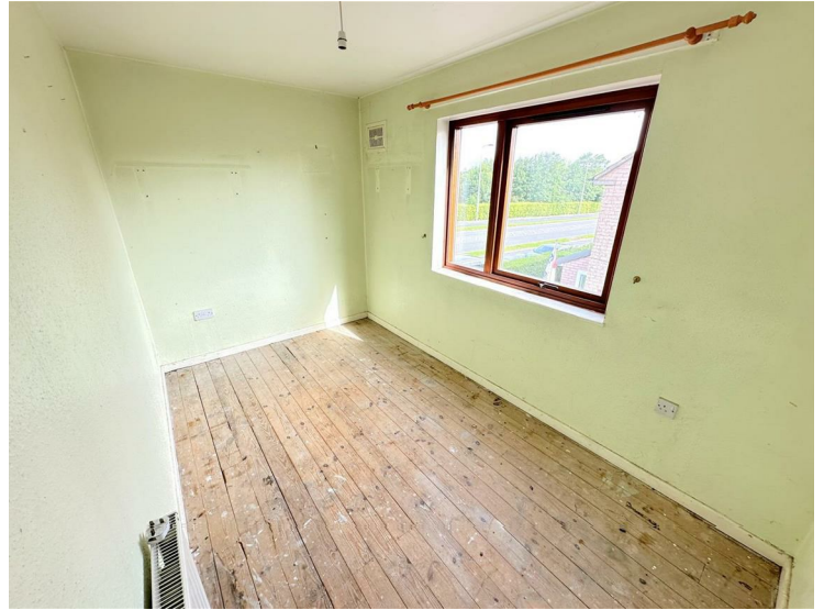
A double bedroom incorporating a double glazed window to side and a radiator.