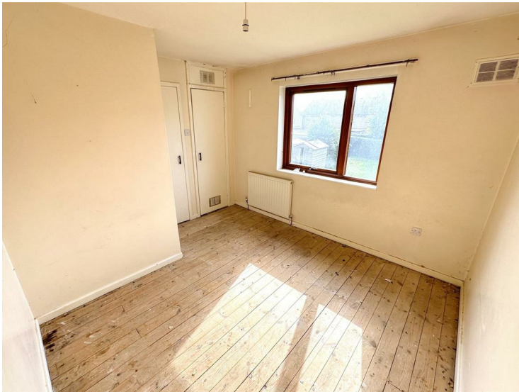
A double bedroom incorporating a double glazed window to rear, radiator, built in storage cupboard and fitted wardrobe/storage.