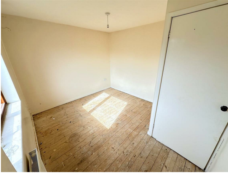
A double bedroom incorporating a double glazed window to rear, radiator, built in storage cupboard and fitted wardrobe/storage.